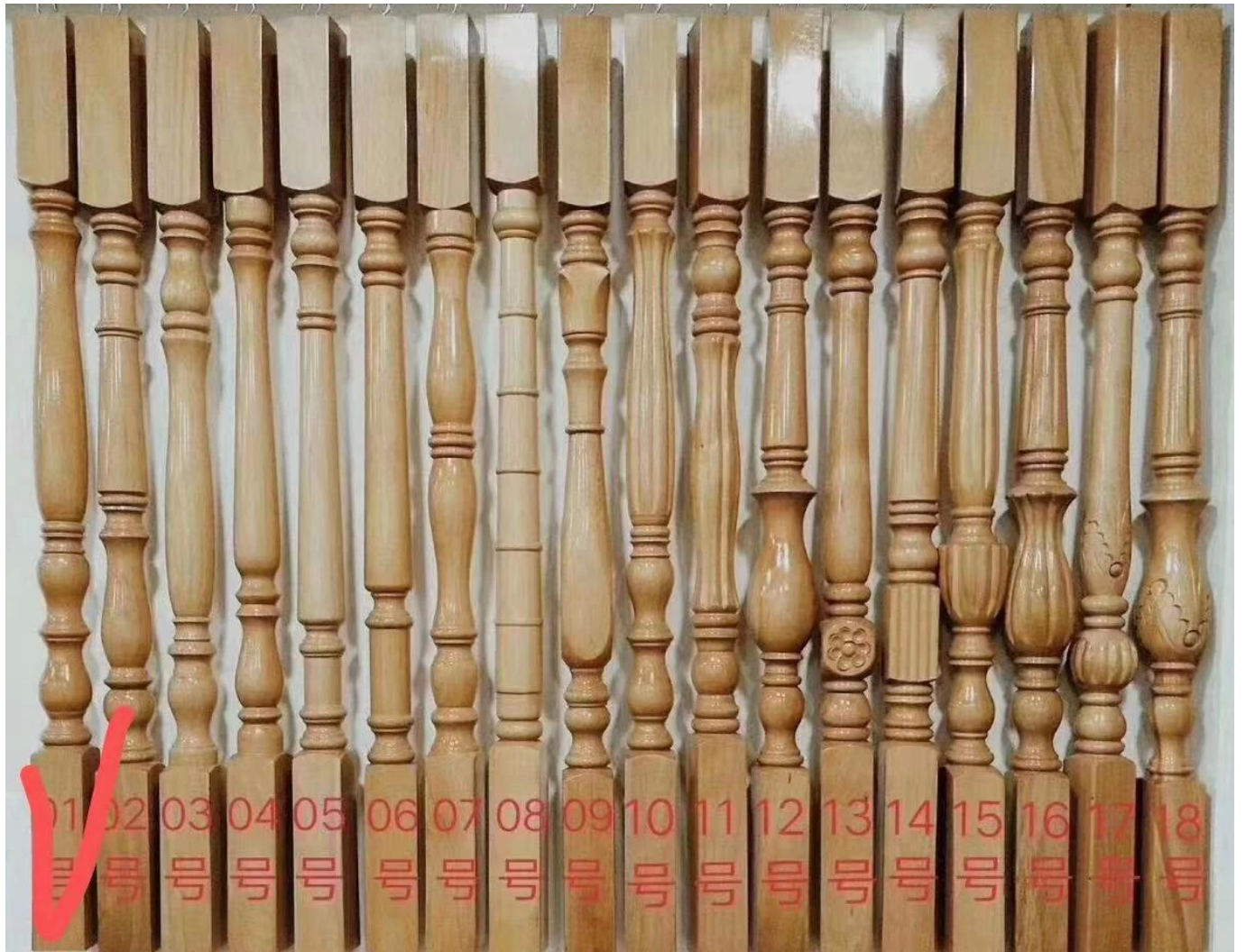
American Red Oak solid wood stairs