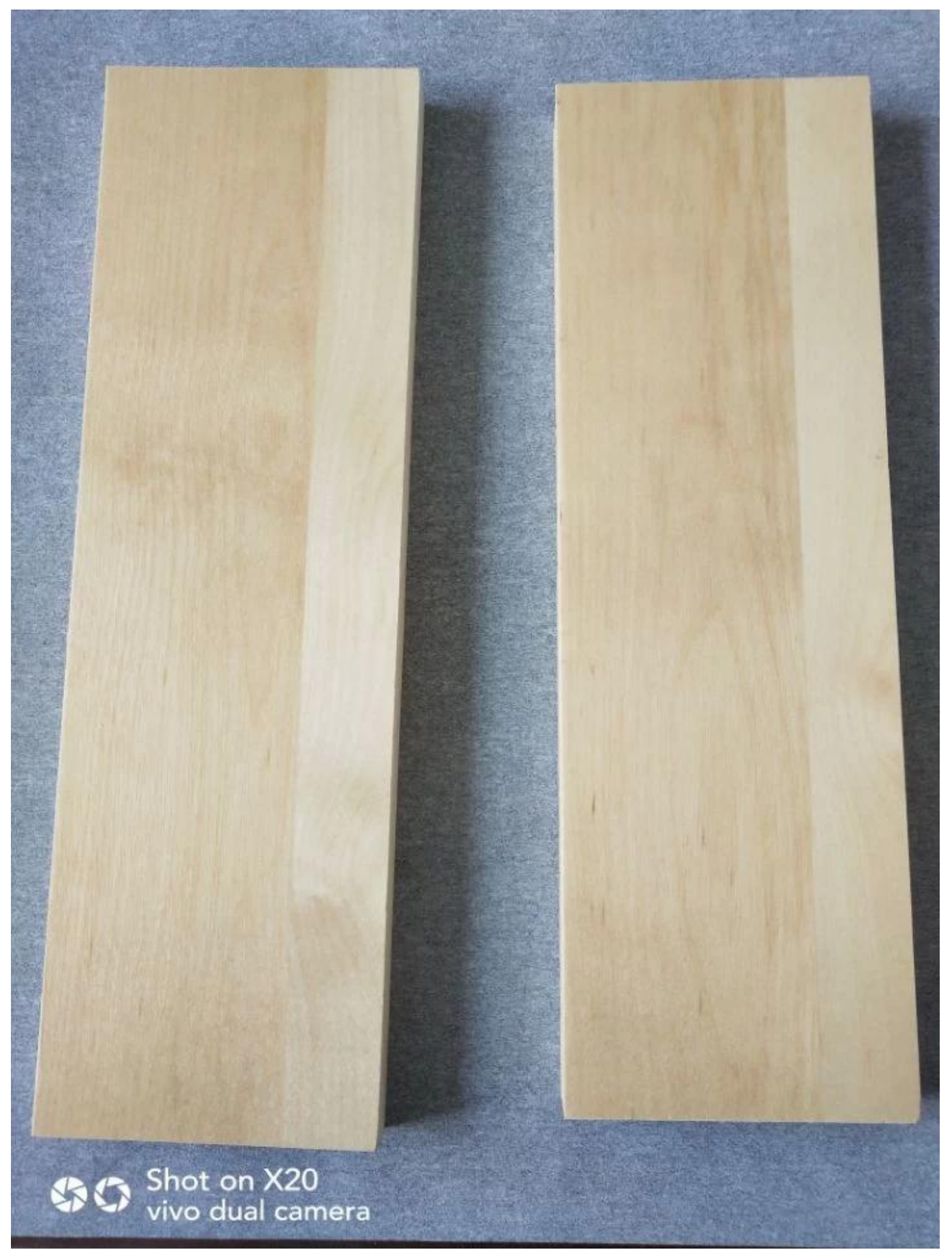
For more details, we are looking forward to your inquiry.