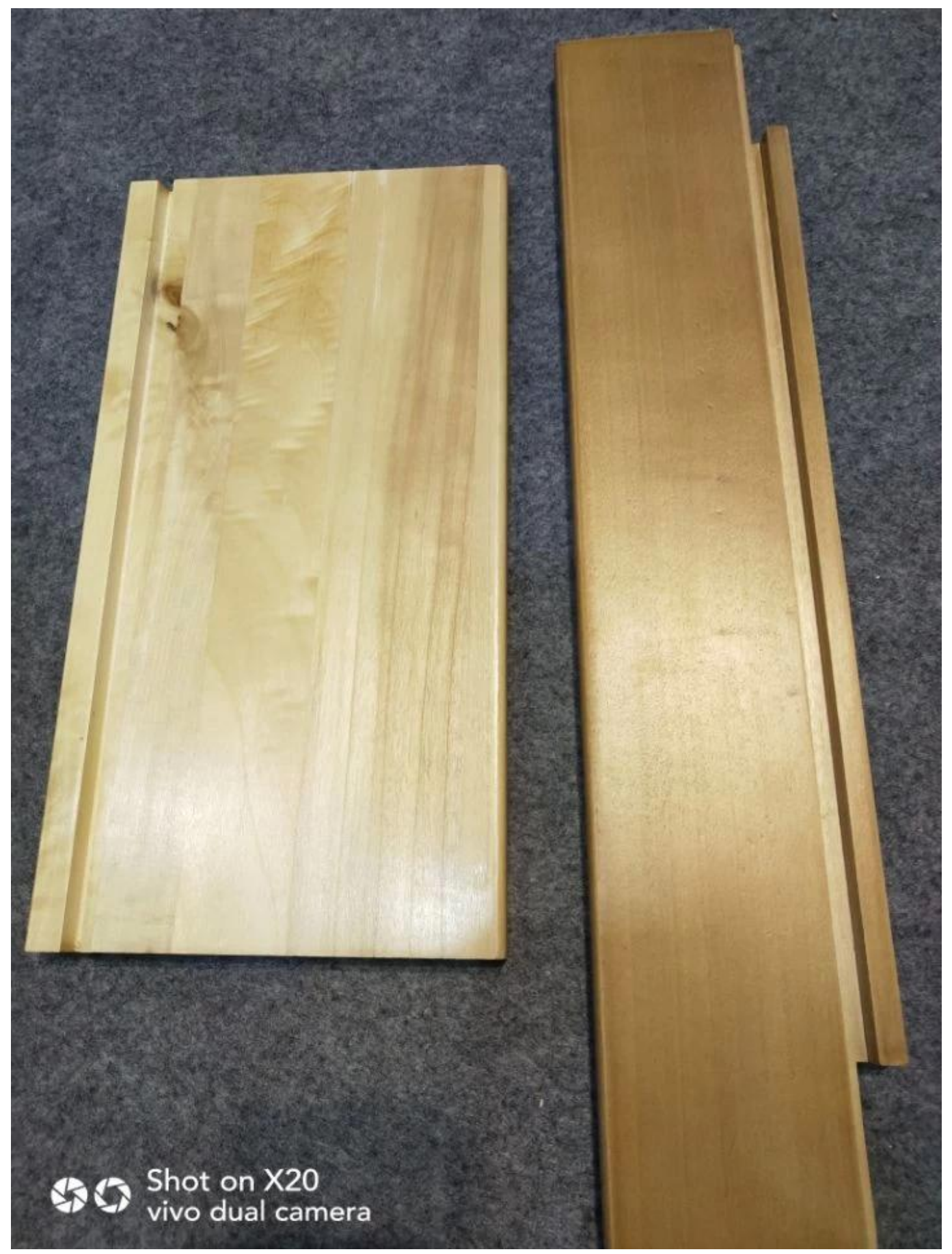
Some birch UV finished drawer panels: