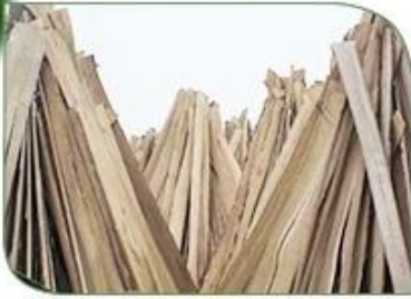
Air dry for about 2-3 months