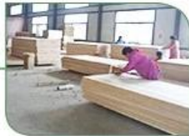
Inspect piece by piece