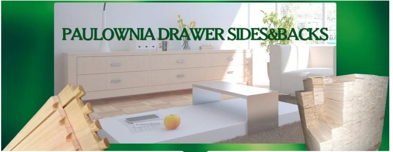
paulownia edge glued panel board product pictures