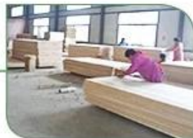
Inspect piece by piece