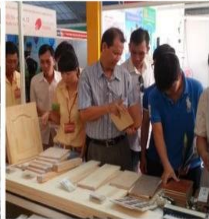
La certificación del FSC: