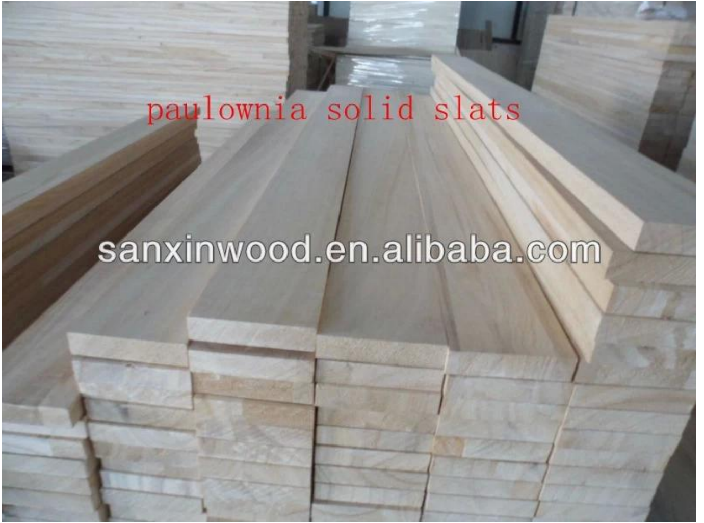
Paulownia baord for making furniture /coffin