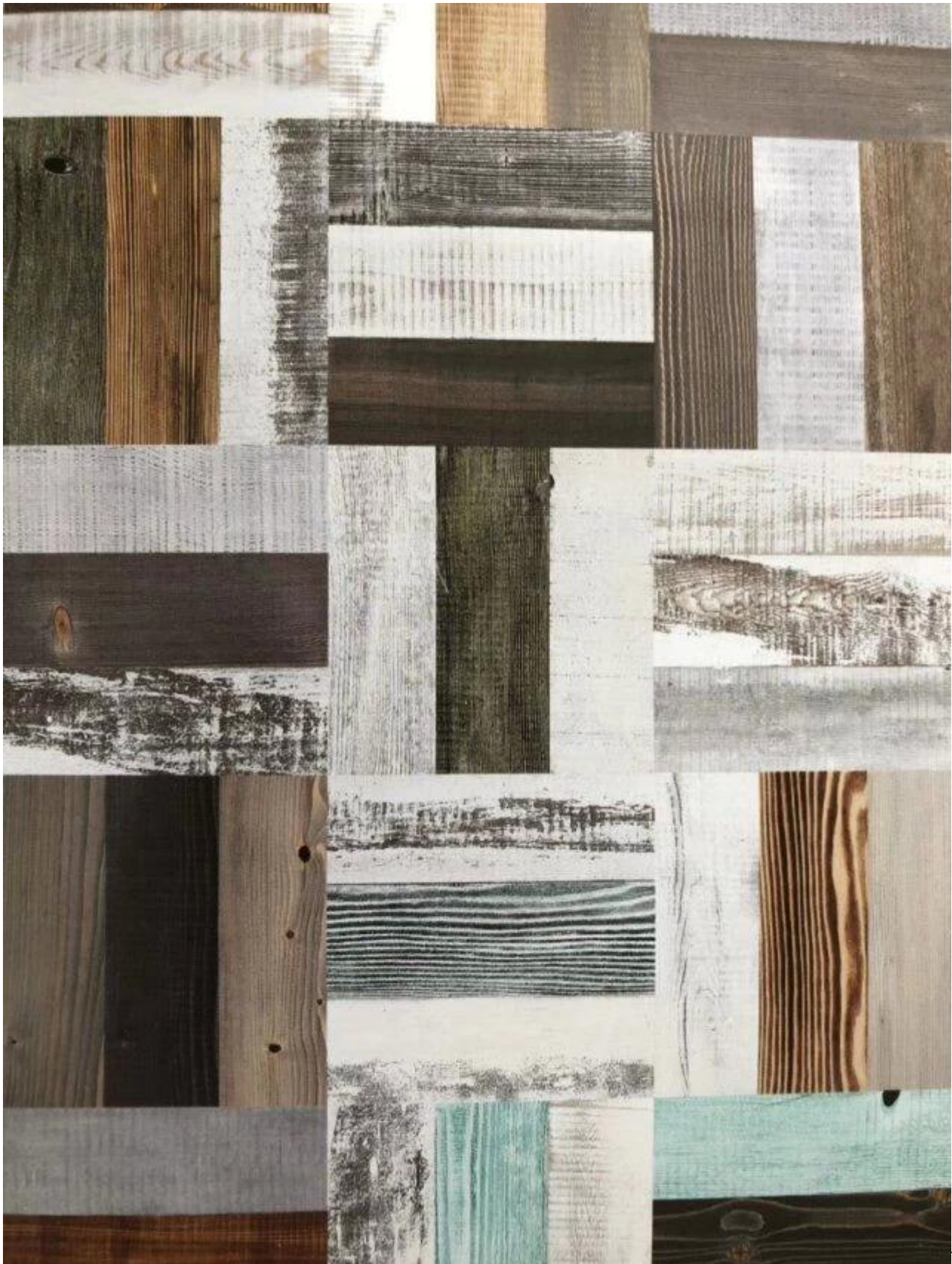
r proof panels