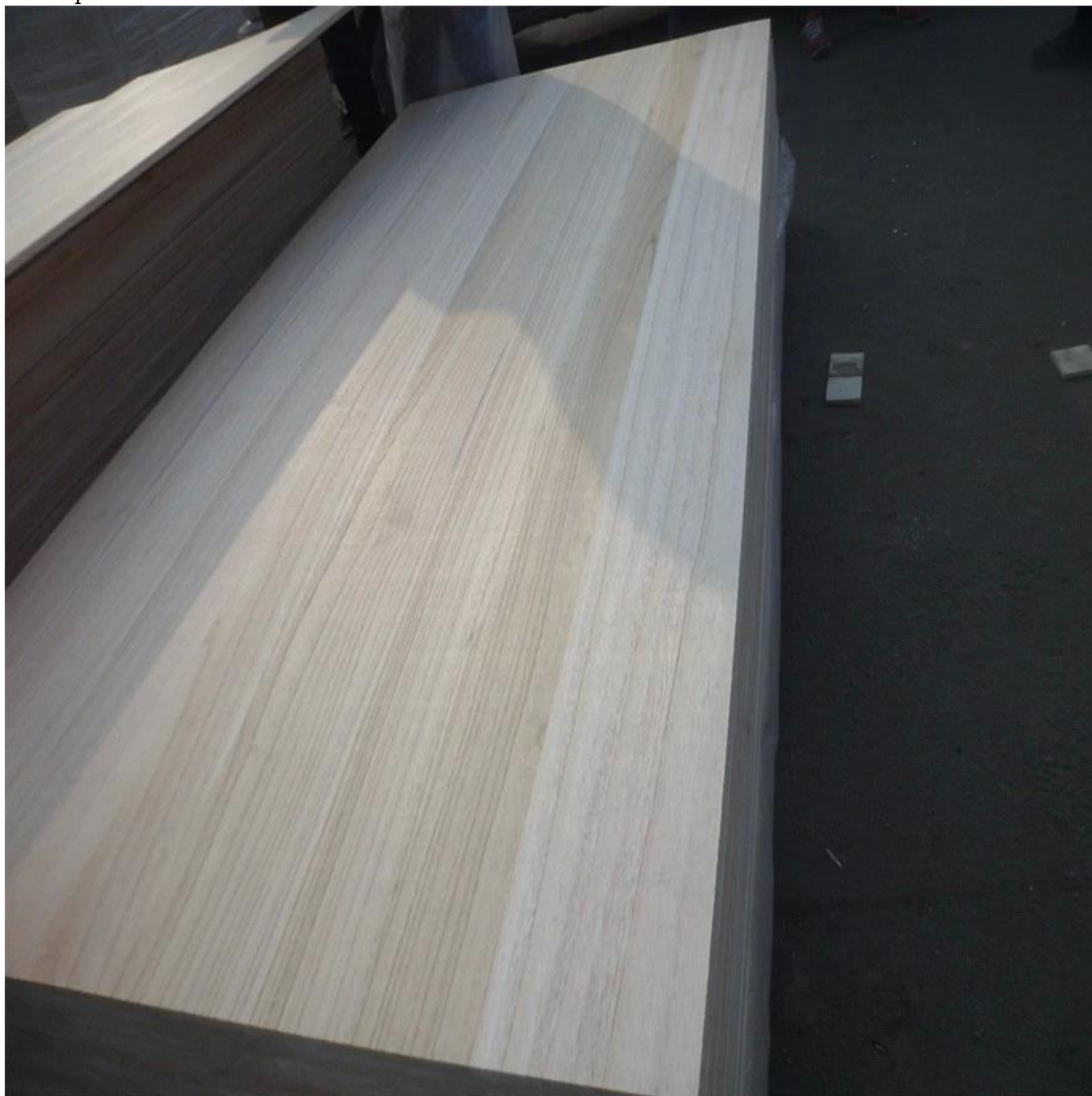
China paulownia coffin boards manufacturer