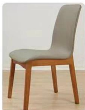
Walnut color + khaki