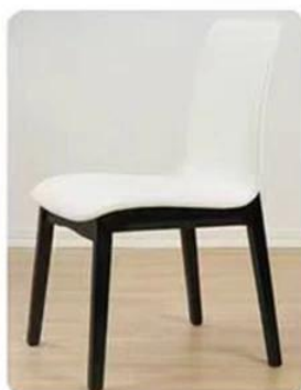
Black + White