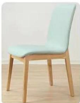
Original wood color + light blue