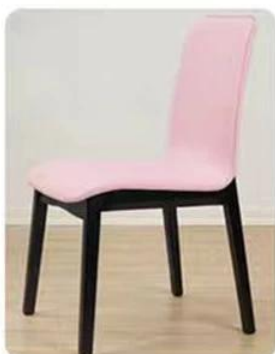
Black + Pink