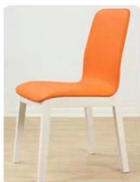
White + Orange