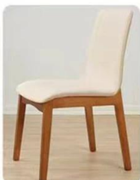
Walnut color + beige