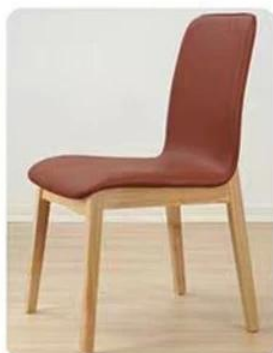
Log + Dark Curry