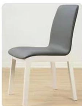
White + Dark Gray