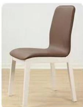
White + Coffee