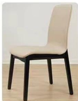
Black + Dark Beige