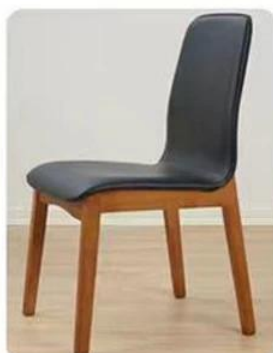
Walnut color + black