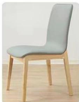
Original Wood + Light Gray