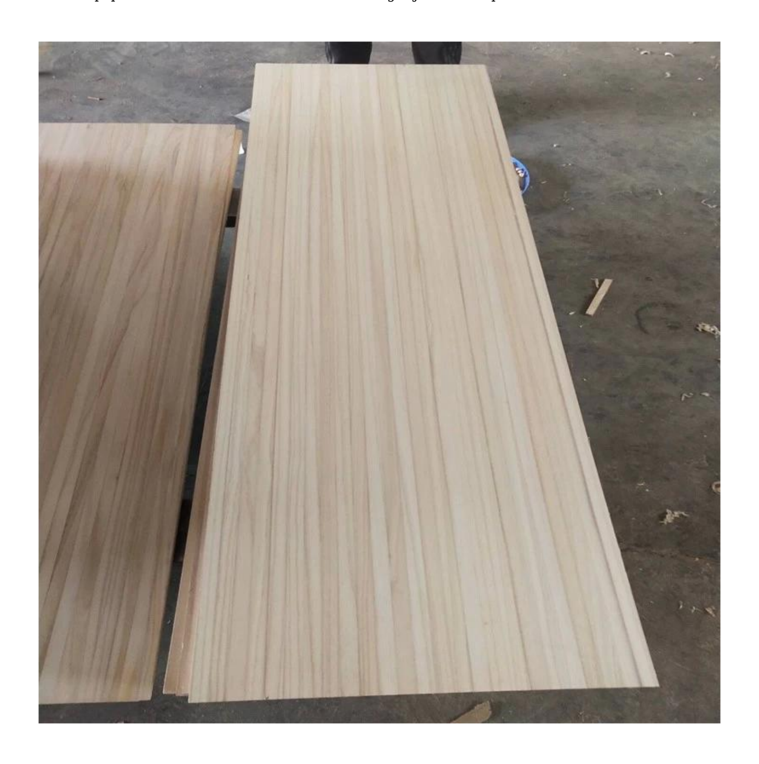
Natural poplar wood core snowboard solid wood finger joint board prices