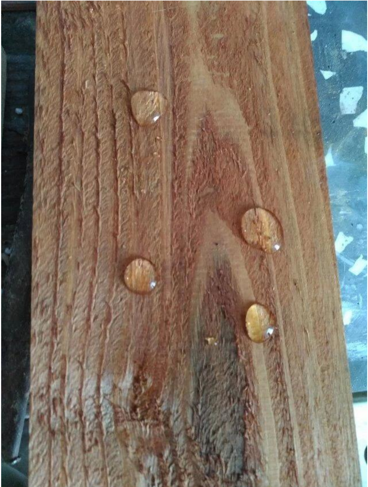
Different kinds of colors and textures