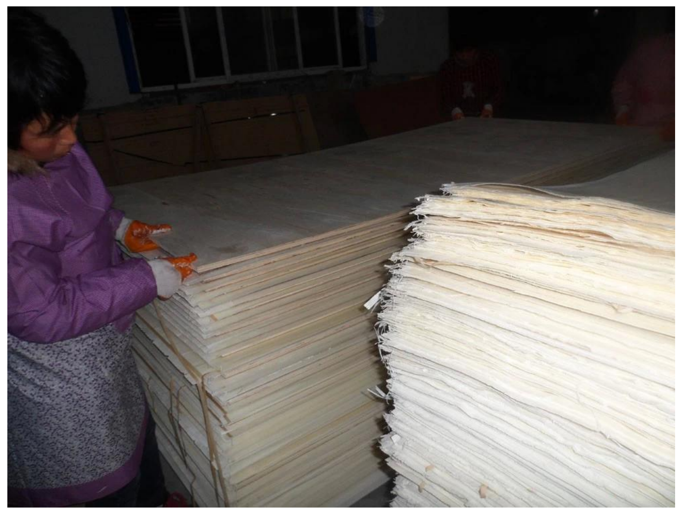
Putting the base plywood on the veneer and MDF