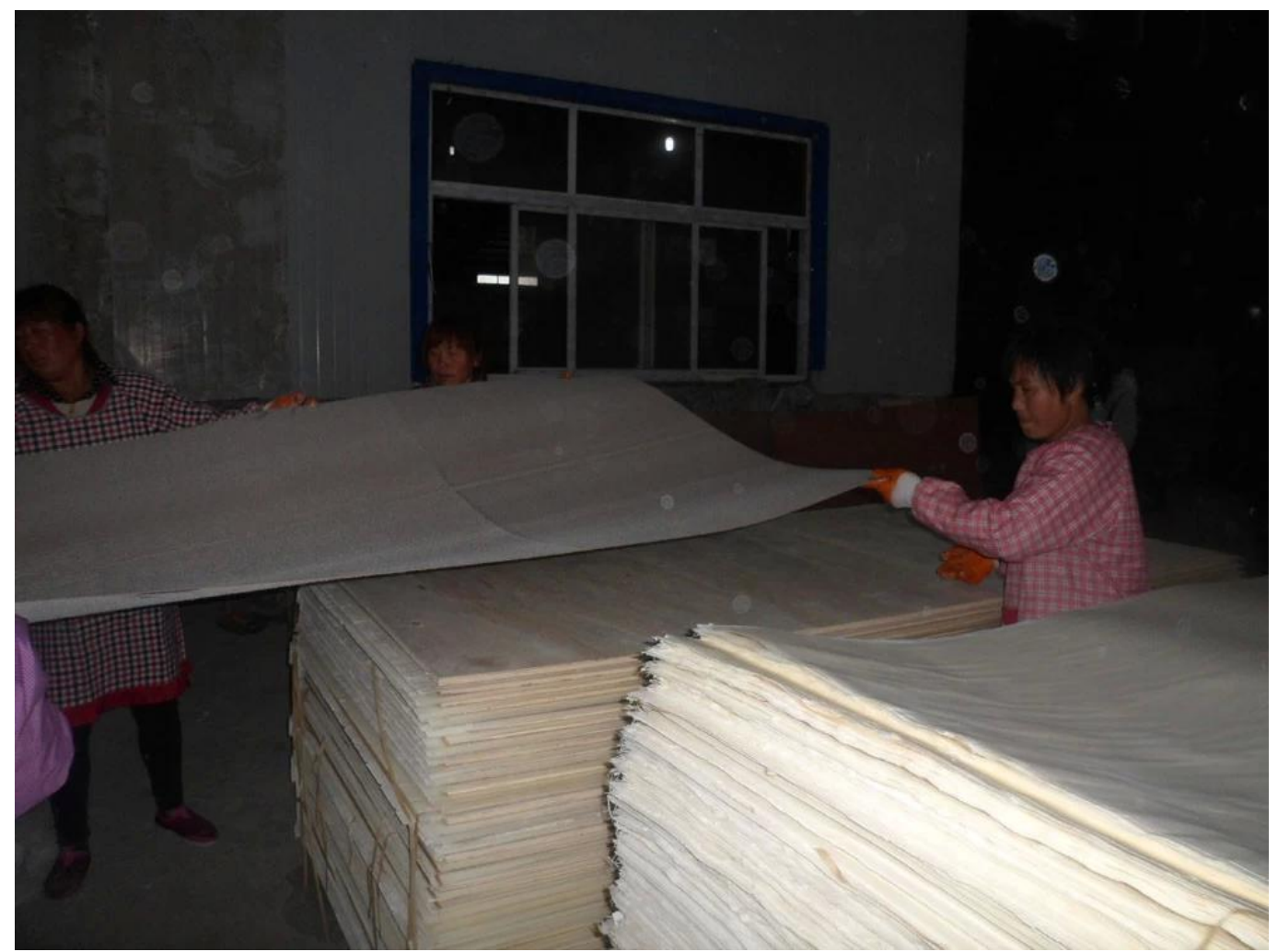
The MDF boards have been painted well by the glue, the veneers have been put on the back.