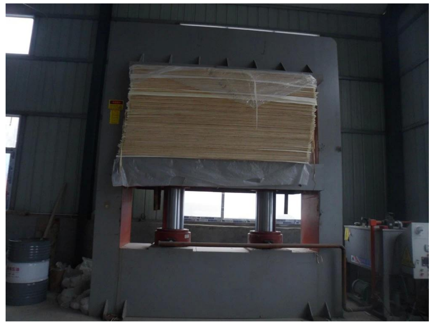
After coverd the MDF and poplar veneer, will be cold-pressing firstly