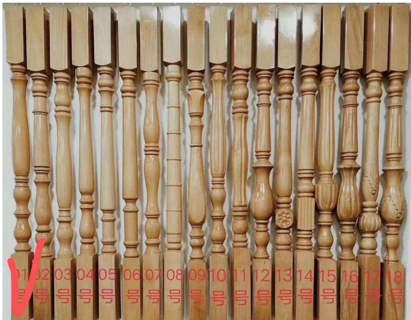
American Red Oak solid wood stairs